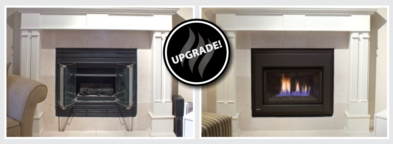
BEFORE Older & inefficient gas fireplace